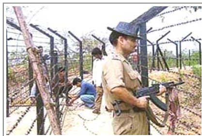
The India Bangladesh border-- A conducive route for human trafficking

Bangladesh government today (June 17) claimed that four lakh women from the country were engaged in forced prostitution in India as it admitted that their trafficking was a "rapidly growing problem" despite massive social and police campaigns. "Every day, 50 Bangladeshi girls are lured across the Indian border and sold," Home Affairs Adviser Major General (Retd) Abdul Matin said, as Bangladesh opened a new police unit to crack down against women and child trafficking. Citing an official report, Matin said 90 per cent of the trafficked women were "forced to engage in prostitution."